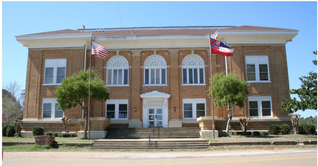
This photograph of the old Webster County Courthouse was taken in March 2011, less than two years before the devastating fire.