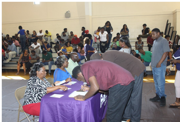
Job applicants sign in before completing applications and sitting for a job interview.

More than 500 people lined up at a church gymnasium in Cleveland to apply for jobs as FedEx Ground package handlers during a Sept. 19 job fair organized by state, local and non-profit groups.