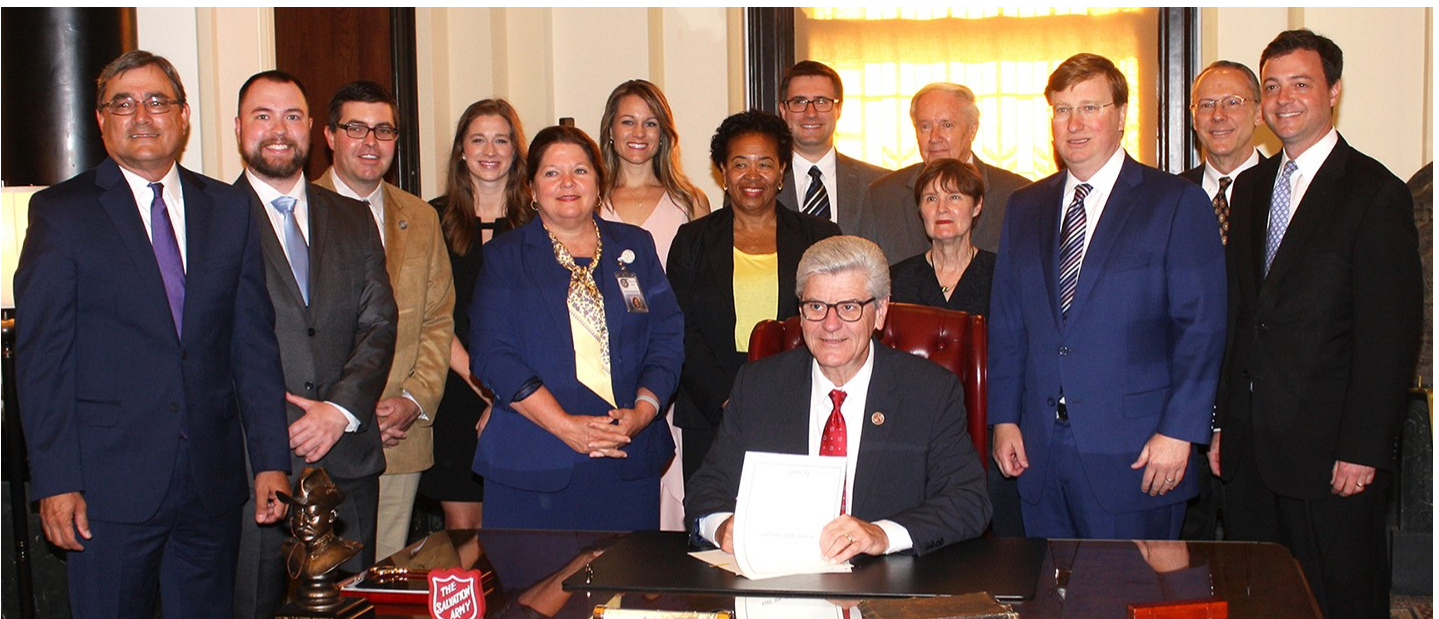
Gov. Phil Bryant ceremonially signs the GAP Act on May 29. He is flanked by Lt. Gov. Tate Reeves and members of the Commission on Guardianship and Conservatorship. See story, Page 2.